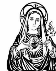
Our Lady of the Sacred Heart

Archdiocese of Birmingham Registered Charity 234216